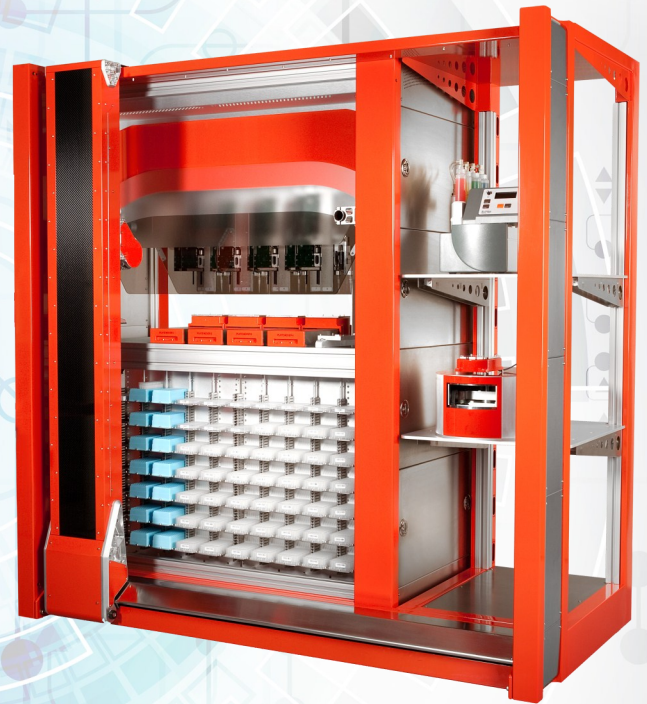
Hive Automation Platform

Adding simultaneous-access storage allows plates and consumables to be loaded and unloaded during runs, eliminating traditional deck resetting time. One side of the storage module is dedicated to the Hive robotic arm while the other can be loaded by an operator or with BeeSmart Karts™, which are manually loaded at sample and consumable labs/stores remote from the Hive. Loaded Karts are driven to the Hive and docked for material transfer. The storage module is fully customizable for any combination of plate types and consumables at any capacity.